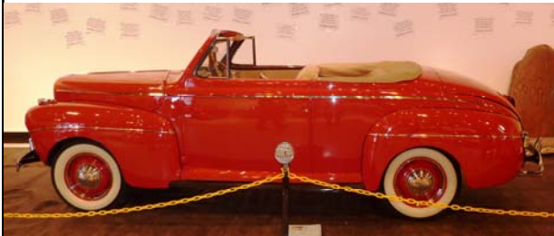
▲ Restored 1941 Ford

Custom cars are works of art and therefore not subject to the rigorous constraints inherent with restorations. Some are monuments to chromium, some have paint jobs that cost more than a new Prius, and some are museum pieces so gorgeous that you would no more consider driving them on the street than you would consider cooking a Faberge egg. For a true motorhead, the creativity and beauty are simply stunning. Enjoy the show!