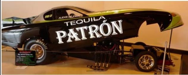
▲ This funny-car does not belong to Jimmy Buffet ▼ Right-hand-drive behemoth Caddy with suicide doors is from Australia