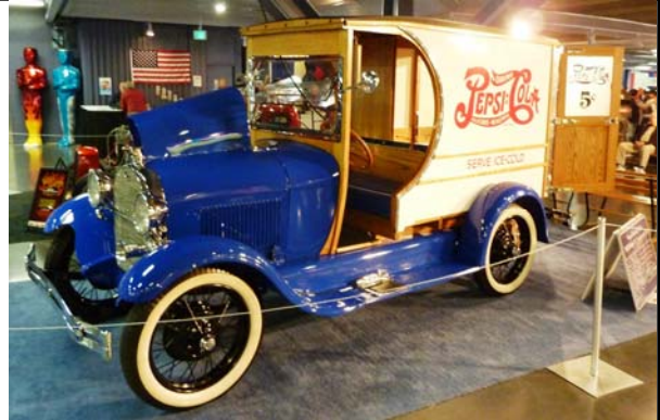
▼ A new application of "chopped top"