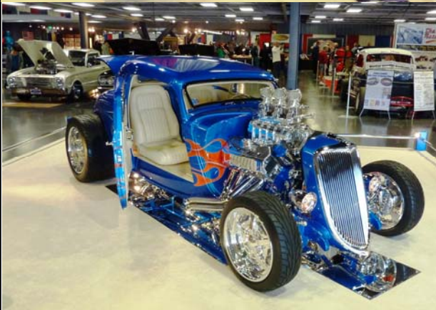
Parking lot special: 1951 Hudson Rambler ►