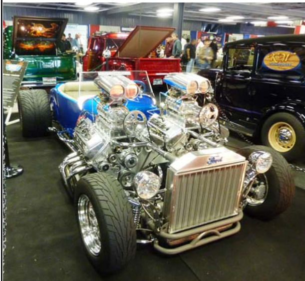
▲ Sometimes one engine just isn't enough. "Double Trouble" has side-by-side blown V8 Ford engines with a total of about 1,000 HP.