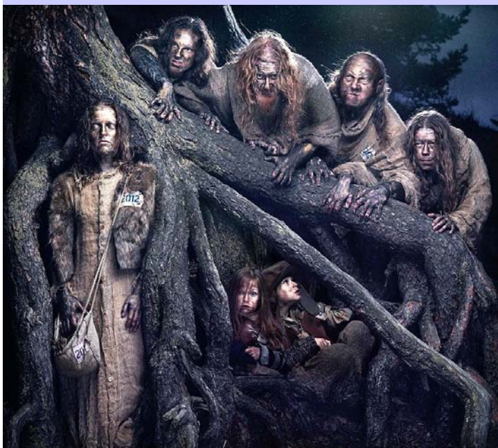
The planning committee was a bit edgy after the four-hour meeting

"Millie, do you think we would attract too much attention with a vintage license plate?"