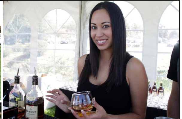
Brandy was served at the Hennessey booth