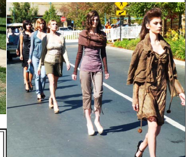
The fashion show