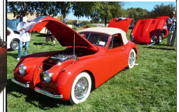
A good day for red Jaguars