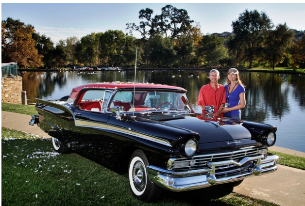
Best of Show: 1957 Ford Skyliner