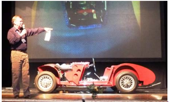
Having sold the body panels, Phil Foster proceeded to auction engine parts