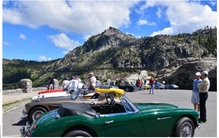
▲ Truckee group at Donner Pass