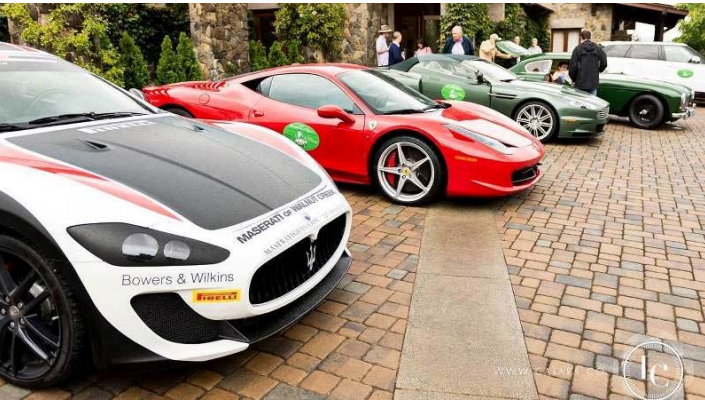
Cars lined up for the Saturday tour