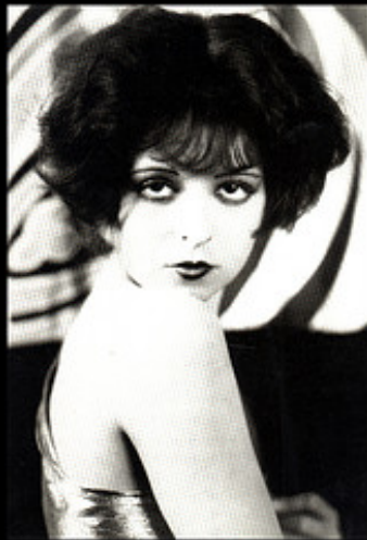
"Honestly, hon, you should attend the Fall Colors Tour" October 26-27; See page 9