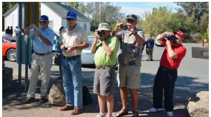
▲ These guys are taking photos of these gals ▼