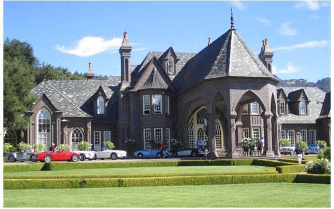
▲ The Ledson Winery. Time for a snack. ▼