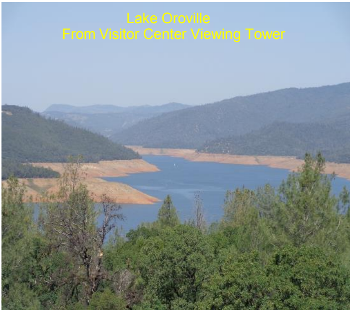
Lake Oroville From Visitor Center Viewing Tower