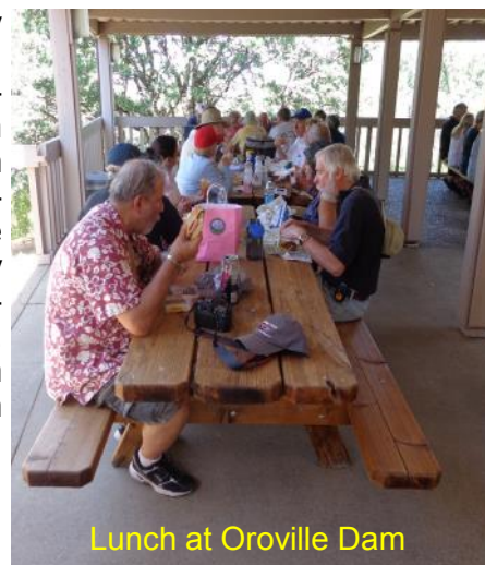
Lunch at Oroville Dam