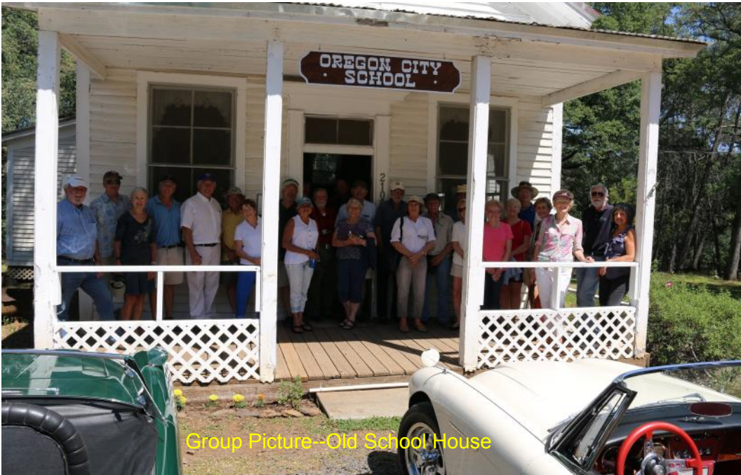
Group Picture--Old School House