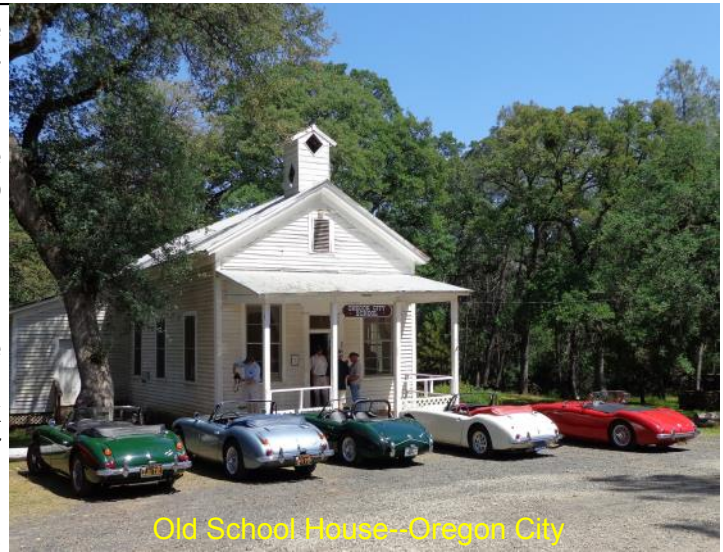
Old School House--Oregon City