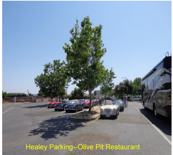
Healey Parking--Olive Pit Restaurant