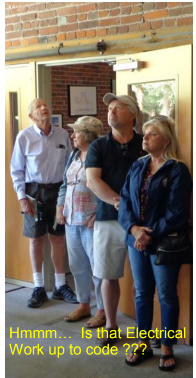
Hmmm... Is that Electrical Work up to code ???