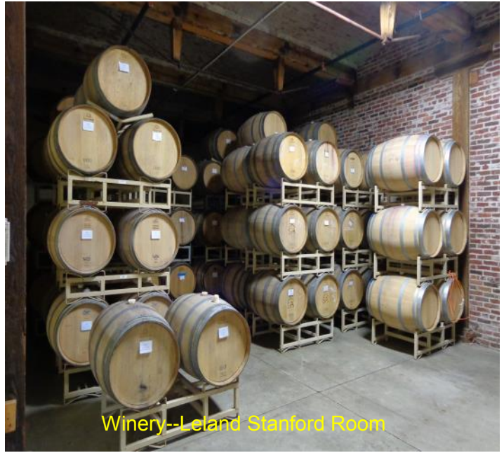
Winery--Leland Stanford Room