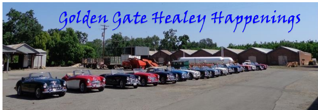
Healeys at The Abbey of New Clairvaux