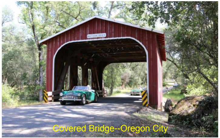
Covered Bridge--Oregon City