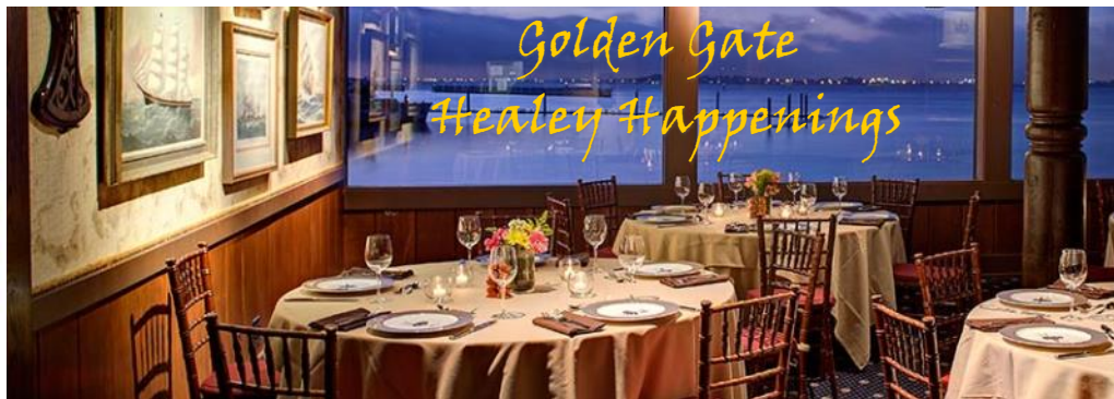
Trader Vic's - The Captain's Cabin