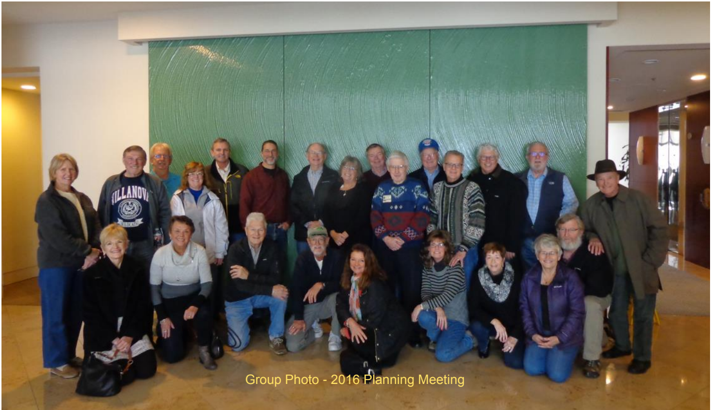
Group Photo - 2016 Planning Meeting