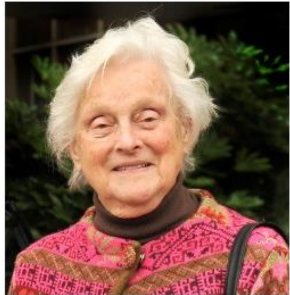
Note: From her Daughters...