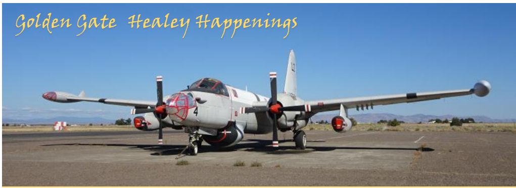
Lockheed P2V-7 Neptune - Erickson Aircraft Collection