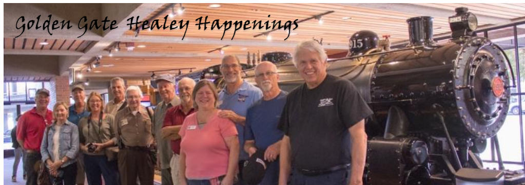
California State Railroad Museum - Old Sacramento