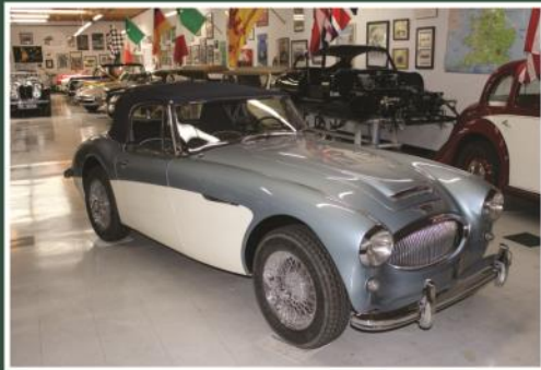
Austin Healey, Jaguar, MG, Triumph Rolls Royce, Bentley, Lotus

call now to talk about your dream... 408.782.1100