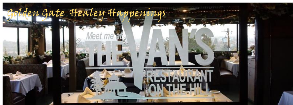
The Van's Restaurant