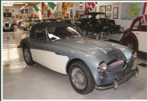
Austin Healey, Jaguar, MG, Triumph Rolls Royce, Bentley, Lotus

call now to talk about your dream... 408.782.1100